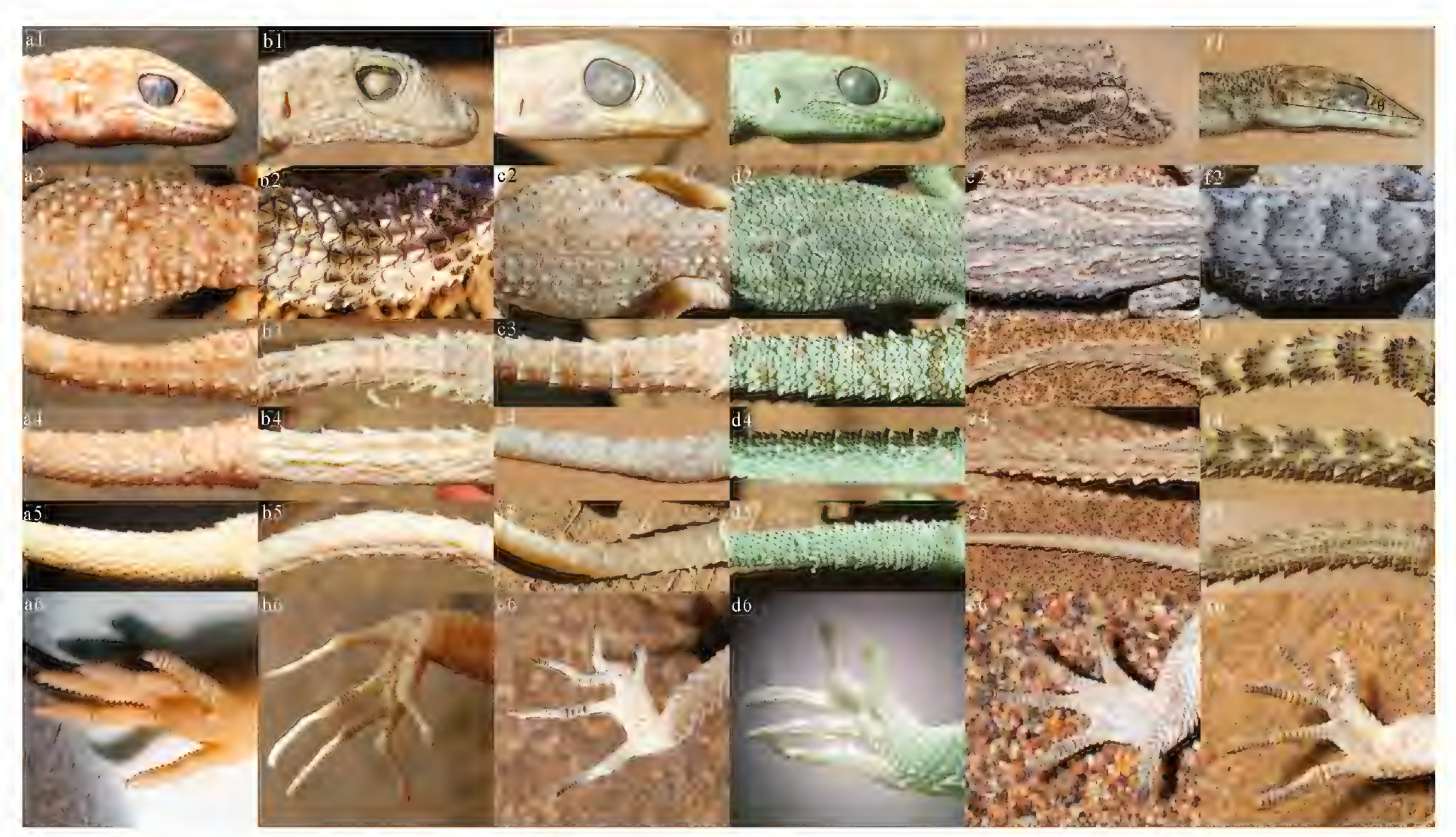
Fig. 2. Comparisons of (1) head shape, (2) dorsal view, (3) dorsal view of tail, (4) lateral view of tail, (5) ventral view of tail, and (6) subdigital lamella of hindlimbs, in the new gecko with other genera. (a) Bunopus tuberculatus , (b) Tenuidactylus caspius , (c) Cyrtopodion scabrum , (d) Carinatogecko heteropholis , (e) Mediodactylus russowii , and (f) Lakigecko aaronbaueri sp.n.

like subcaudals); dorsal scales elevated and overlapping (vs. non-elevated or flattened cobble-stone shaped) and a greatly flattened and elongate head (vs. head oval and more massive); from Mediodactylus Szczerbak and Golubev, 1977 by having keeled, tubercular scales forming the end of each caudal segment (vs. in the middle of each segment), at least 14 sharply keeled tubercles in each caudal whorl (vs. a semicircle of six whorls: three on left and three on right), caudal tubercles in contact with one another laterally (vs. not in contact), caudal tubercles forming a relatively complete ring around the tail (vs. distributed only on the dorsal half of the tail), and a flattened and elongate head (vs. not); from Carinatogecko Golubev and Szczerbak, 1981 by smooth subdigital lamellae on the forelimbs and hindlimbs (vs. keeled transverse subdigital lamellae), and smooth dorsal scales (vs. strongly keeled); from Tenuidactylus Szczerbak and Golubev, 1984 by the lack of femoral pores (vs. more than 20 femoral pores), ventral subcaudals small and strongly keeled (vs. plate-like and smooth), 14